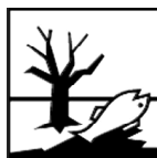
Dangerous for the environment

Hazard designation: Harmful; Highly flammable; Dangerous for the environment