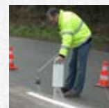
PREMARK® is always ready to use – all year round