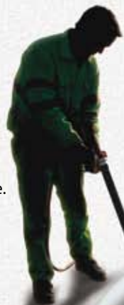
Applying PREMARK® is fast and simple because all you need is one person, a broom and a portable gas burner

PREMARK® helps to ease traffic flows every day all over the world and guide road users safely on their way using well-known traffic symbols. The PREMARK® product range includes all the officially registered traffic symbols, signs, lines, arrows, figures and letters.