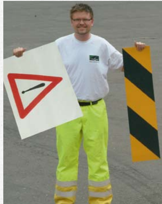
In this example, PREMARK® Easy is shown

So choose PREMARK® whenever you need proper, flexible, high-quality road marking made of preformed thermoplastic.