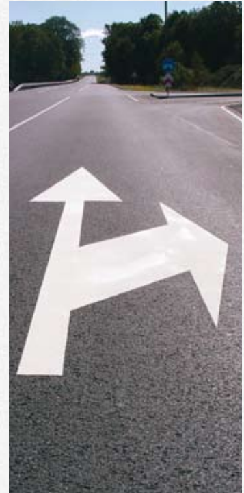
PREMARK® 'leaves its mark' on quiet residential streets, hectic urban centres and major highways