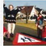
PREMARK® helps to guide and inform road users all over the world