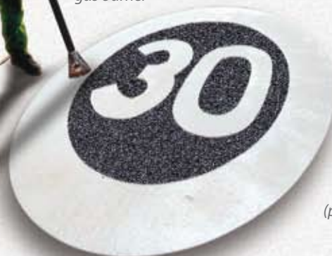
PREMARK® can be applied to a variety of surfaces (pictured: tiling)